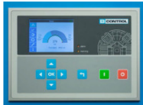
B-CONTROL MICRO compressor control

The optional compressor control B-CONTROL II has been conceived for demanding applications.