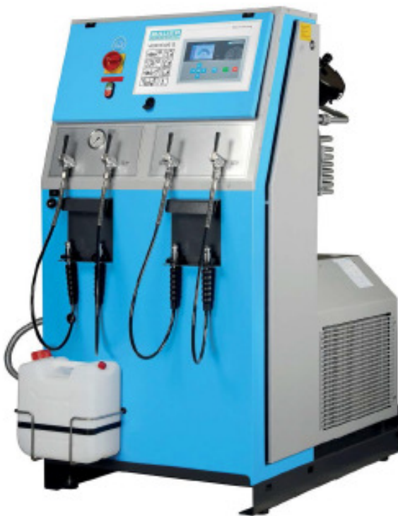
VERTICUS open version