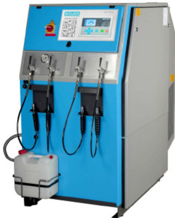
Super Silent version